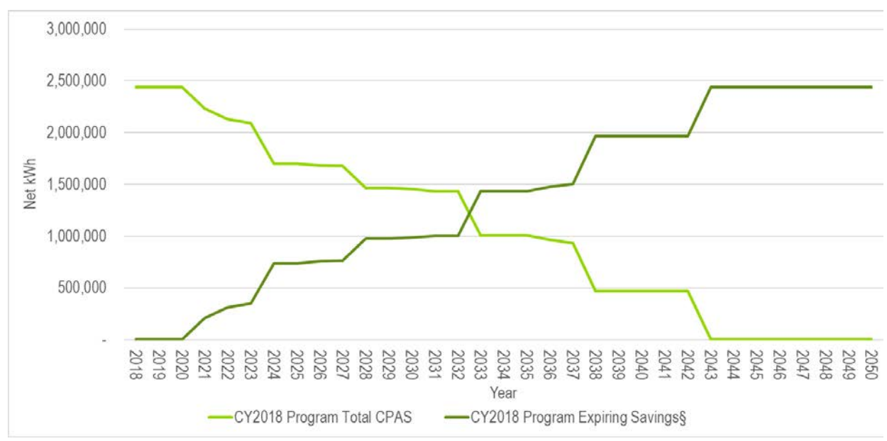
Figure 3-2. IHWAP Cumulative Persisting Annual Savings

§ Expiring savings are equal to CPAS Yn-1 - CPAS Yn + Expiring Savings Yn-1.